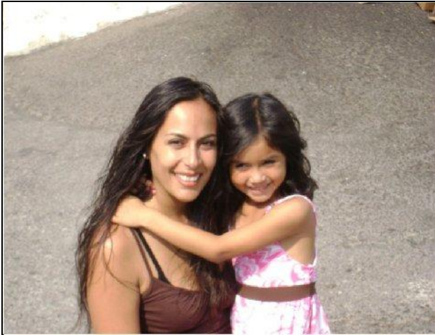
Graduate, now employed by EMQ-FF