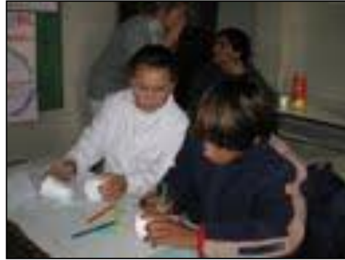
Exercise with Cups Teaching Feelings-Defenses