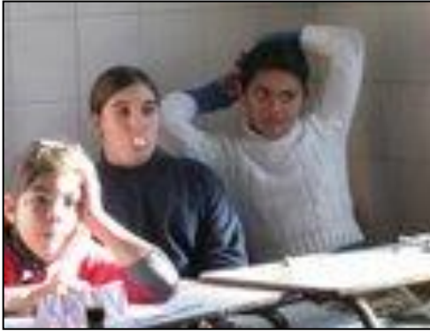
Preparing for Bubble Gum Family

An additional pilot site for ¡Celebrando Familias! and translators of pre-adolescent and adolescent age-group.