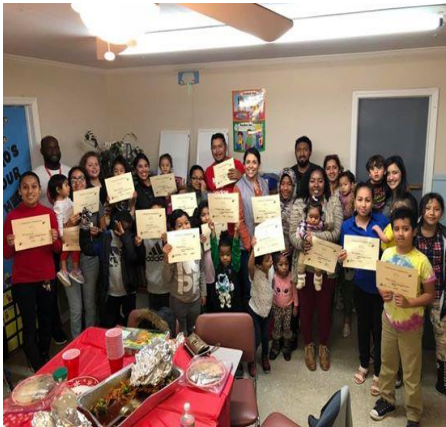
Celebrating Families!™ Nation Wide!